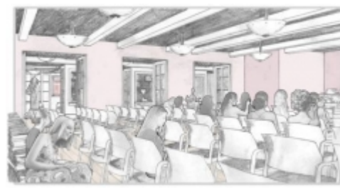
Omicron Chapter Meeting Room