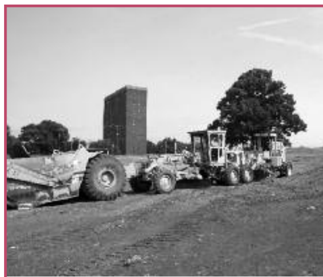
Bulldozers now preparing UT Morgan Hill Sorority Village site

Yeah! Dirt is being moved, utilities put in, and roads being built. Finally, the first step in the construction of UT's Morgan Hill Sorority Village – building the infrastructure and preparing the site – is well underway. Watching this development is thrilling, especially since local AOII alumnae have been diligently working on this project for 10 years. Excitement is HIGH as our dream of an AOII house is becoming palpable!